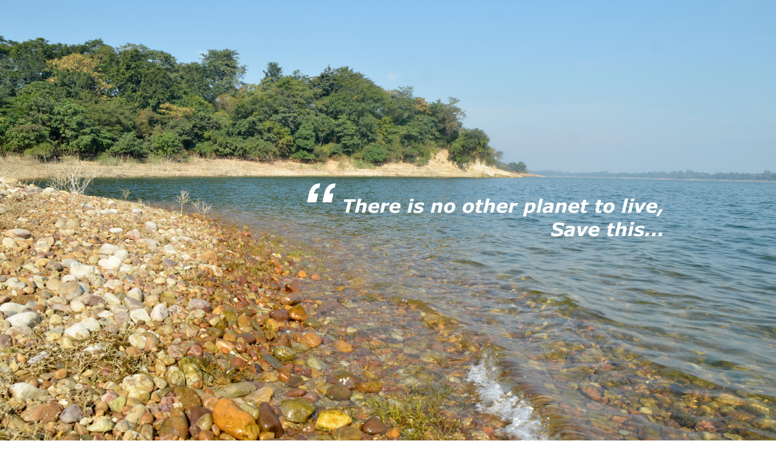
As per the "Eco Friendly" means not harmful to the environment.

"The Pong Eco Village" is the one of the best Eco based Property which called Eco friendly, when we started to work on this project only with a vision to complete it soon with a team of men and without any machine and without harm our Eco surrounding 'In An Eco Manner'. It took the whole team exactly a year to give shape to the vision and finally 'The Pong Eco Village' came into existence. Located on a cliff surrounded by water from three sides, the property derives its existence from how the houses were made 30 -40 years back with mud. The structure reflects the age-old construction ways with a blend of modern amenities.